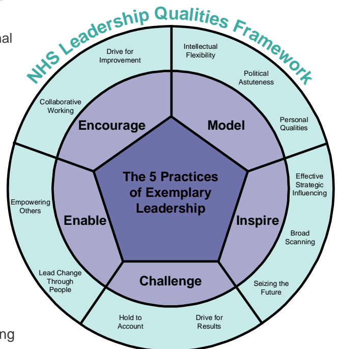
Figure 1 5 practices of exemplary leadership - Kouzes and Posner

The strong links we have developed at Healthskills between the NHS LQF and K and P model enables all